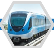
Public Transport Metro, Bus, Taxi