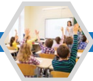
Education Schools, childcares & nurseries