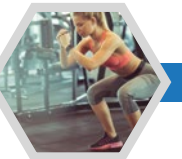
Leisure Common area, gyms, swimming pools