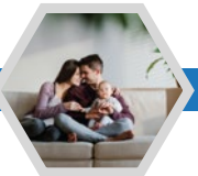
Household Furniture, kitchen & toilets