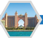
Hotels Rooms, public areas, mattresses, seating, fabrics, food production