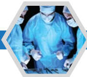
Healthcare General and clinical and dental

THE MOST COMMON APPLICATIONS ARE IN THE FOLLOWING SECTORS: