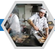
Restaurants kitchens, storage areas, dining areas and toilet facilities