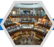
Malls Common areas, toilets & Elevators