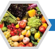
Agriculture & Poultry Food and grain storage, animal & bird farms, fruit and vegetable production, packing and preparation