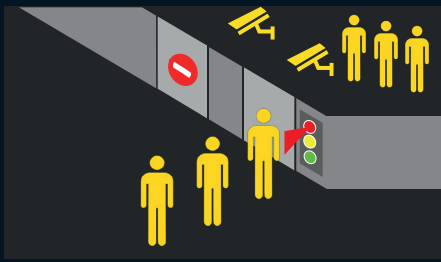
The maximum number of customers is reached, the entrance remains locked.