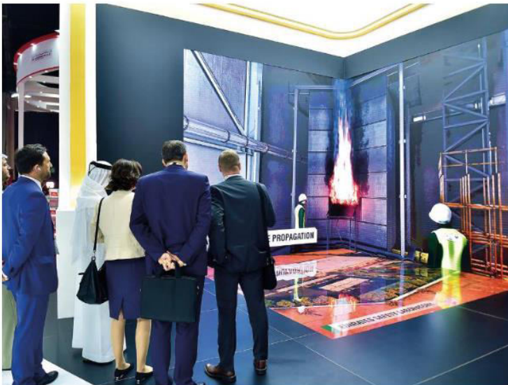
The Directorate General Of Dubai Civil Defence stall at the Intersec 2019, the ongoing trade show for security, safety and fire protection under way at DWTC.

“Our team of experts has extensive experience in fields such as fire resistance testing with loading, reaction to fire and façade testing. We will have Emirati skilled employees to work in the lab in the coming three years”