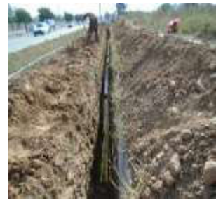
Fiber Connectivity 2000 KM