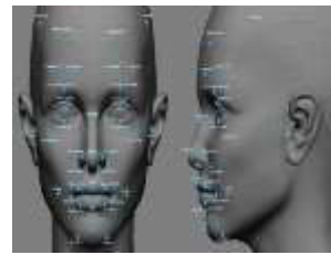
Facial Recognition Control List