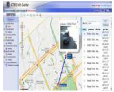
Police Video Hotline for Lahore