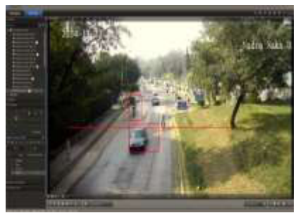
Intelligent Video Surveillance 8000 Sensors