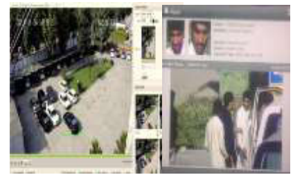
Big Data Analysis