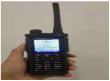
4G Multi-Media Trunking 5000 Handsets