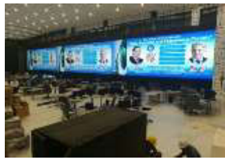
Emergency Command Center Largest Video Wall for Policing